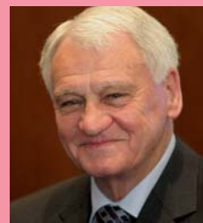
Sir Bobby Robson

“I’m extremely proud that this Cancer Trials Research Centre is based here in my native North-East. I’ve no doubt that it is one of the best facilities of its kind, not just in this country, but in Europe.”